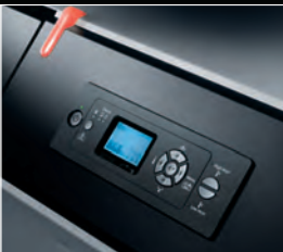
Easy-to-Use Front Control Panel and Error Alert Lamp Large, 2.5-inch LCD panel for easy printer operation, including internal media heater controls. Highly visible Error Alert Lamp quickly alerts the operator of any printer errors.