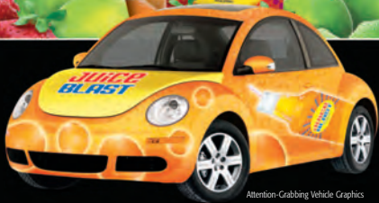
Attention-Grabbing Vehicle Graphics