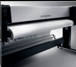
Professional Roll Media Handling up to 64 inches Wide Industry standard, rear-in, front-out, roll-to-roll media handling.