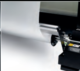
Professional Automatic Take-up Reel System Robust take-up reel system for complete, long-run, unattended production.